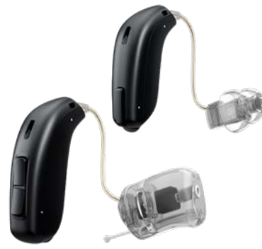
■ Bass, Power dome & Power mold